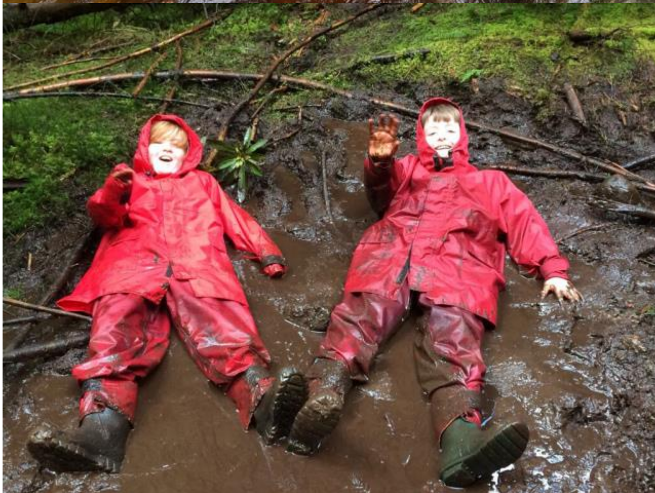
P7 at Benmore this week – For many more photos visit the blog on the school website